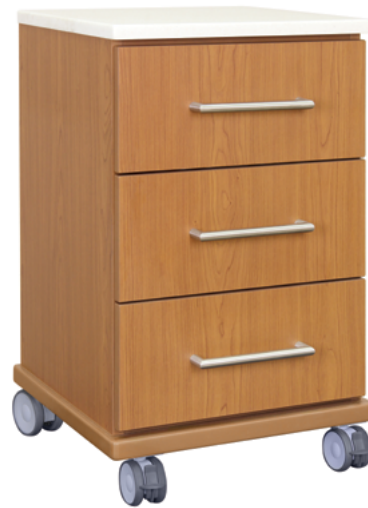
Model: NYBS30CT 19W 19D 30H

Kwalu's New York Collection is designed exclusively for the healthcare market. The Mobile Cabinet is staged on a platform giving it the perfect height for the patient's use, in or out of bed. Its height and edging protect the finish to keep the unit in pristine condition. Other standard features include a ventilation grommet at the back of the unit, locking casters on the front and non-locking casters on the rear. Choose a top of Corian material or Kwalu. Optional drawer liners are removable for easy cleaning. This product is designed for personal items and supplies. It is not intended for clothing storage.